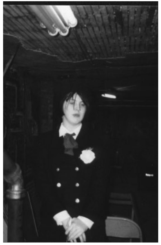
Halloween Party at The A-Zone, October 2002

go into detail about the party, but suffice it to say it was a wild night. Most of the attendees were anarchists or queers or both, and - anarchists know how to party (at least, the "If I can't dance it's not my revolution" types do), queer people hella know how to party, and queer anarchists throw just the best parties. But the most important thing that happened that night was that I joined a chapter of Food Not Bombs, and I found out about the Autonomous Zone. The Autonomous Zone, during the time I spent there, was housed in a dingy storefront on Milwaukee Avenue, wedged between a hair salon and an empty shop that once sold storm windows. It was home to one of the most vibrant communities I've ever been part of. It was the place we mobilized before protests, and the place we met afterward, to figure out who was in jail, who needed bail money, who needed their medication taken to them. It was