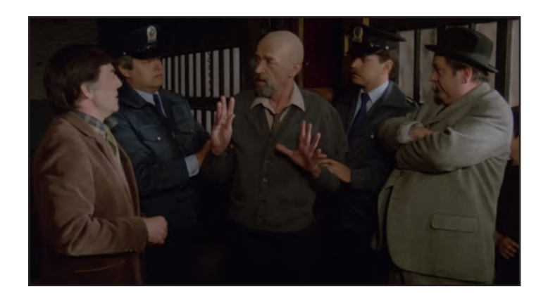
EL SIGOR GETS NABBED.

into the painting to see what scared Michael. The Signor accepts the challenge and ends up getting frightened just like Michael did. The Signor loses his hair and has now broken the curse on Michael's hair, which finally stops growing. The police eventually show up, all the children are freed, and Michael makes his way home to his family.