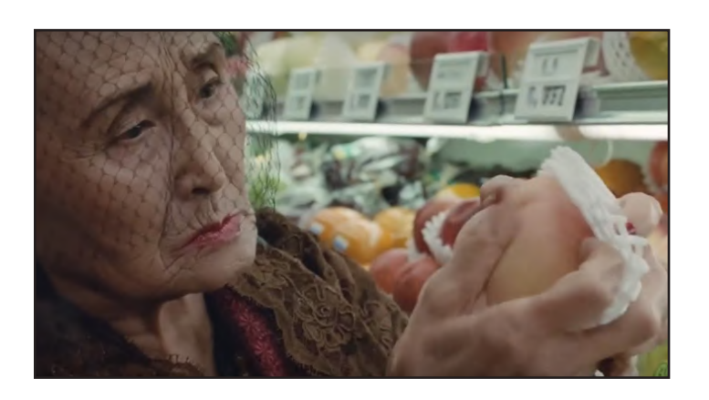
EASY PEASY SQUEEZY SQUEEZY.

We see a junior executive stun his superiors by breaking protocol to order a fancy French meal. An etiquette teacher tells her pupils they should never slurp their noodles, only to be interrupted by a large man loudly scarfing down his. The gangster and his girlfriend use food as foreplay. A man is pained by a wicked toothache. A woman rises from her deathbed to cook one last meal for her family. A vagrant breaks into a kitchen to make a flawless rice omelet. A conman asks to finish eating before his arrest. A man in his last moments of life explains how to prepare wild boar. And, in what feels like an ode to vaudeville, an old woman sneaks around a grocery store, squeezing the food.