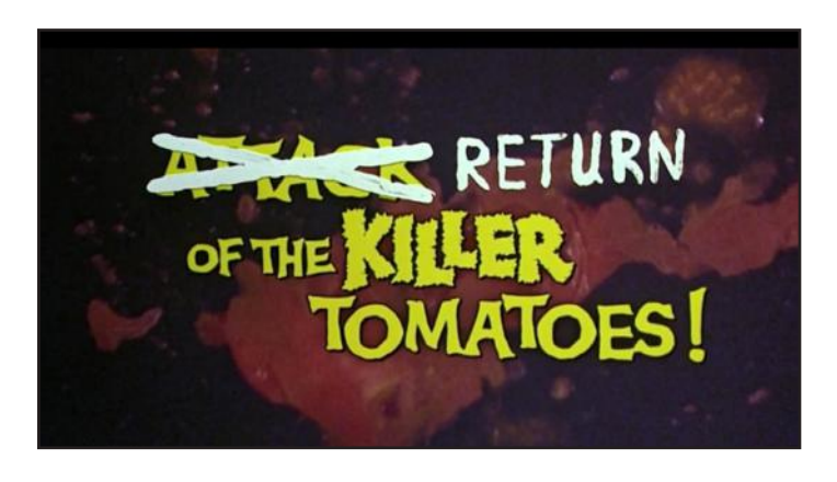
SEE HOW CONSERVATION-MINDED THEY ARE!

Return of the Killer Tomatoes! is a hilarious 80s romp and a self-deprecating look at the film industry and modern media. This is not a movie to be taken seriously and should be appreciated for its spot-on humor and gags (those first act set-ups really come through in the big finale), its light critique of society's foibles (including our obsession with media), and for demonstrating how meta can be done right.