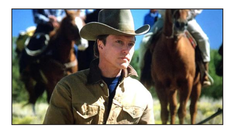
KYRIL AIN'T KOOL WITH FUNNY BUSINESS.

And that's what this movie does – it elicits chuckles. And right down to the end when (spoiler alert) Kiryl, having been forced to retreat from arresting