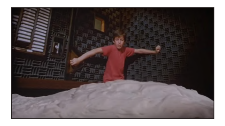
THE GOO IS COMING FOR YOU!

become. The trio spend the second half of the movie dodging Stuffies as well as murderous blobs of The Stuff itself. At one point, it even tries to suffocate Mo like it was the Face Hugger from Alien .