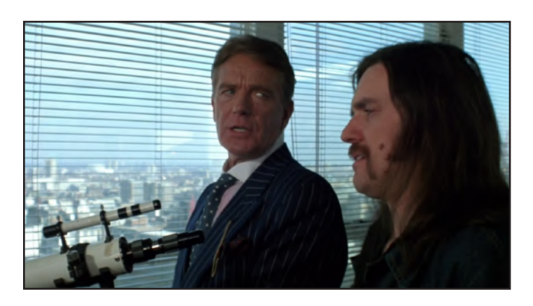
COMMANDER FORTUNE AND SPIDER DO SOME SCHEMING.