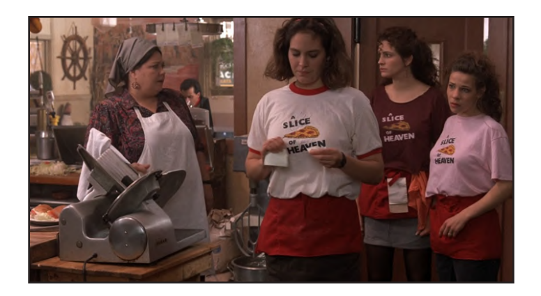
KAT SHOULD HAVE PUT THE CHECK IN THE MEAT SLICER.