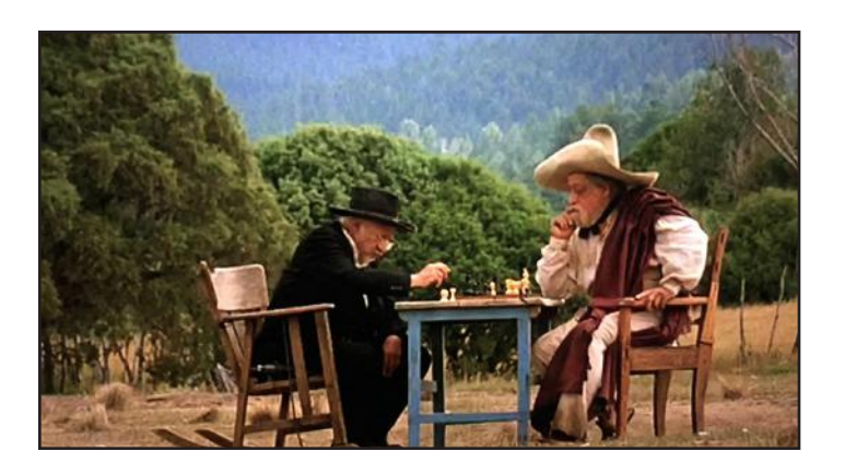
CHICANO FOLKLORE, SEVEN SEALS STYLE.

been something great if Redford had deepened the Western-like qualities by letting the villains stick to their guns and the hardships of the terrain equate to some real suffering, or had he put some more research into Chicano folklore. Of course, either choice might have reduced the 80s Hollywood feel.