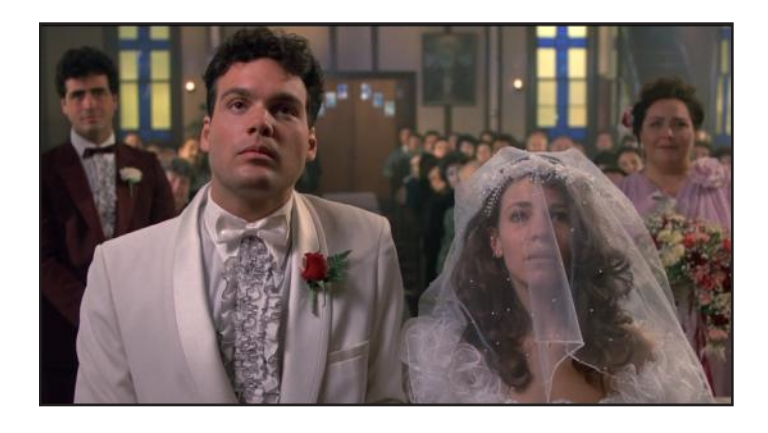
THE FACE OF A WOMAN WHO DOESN'T WANT TO MARRY.

are forced to contend with their differences (not only class differences but also Daisy's immigrant roots) and their contentious relationships with their parents.