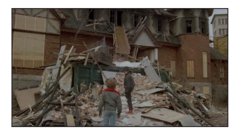
THERE IS A BIG FRIGHT LURKING IN THERE.