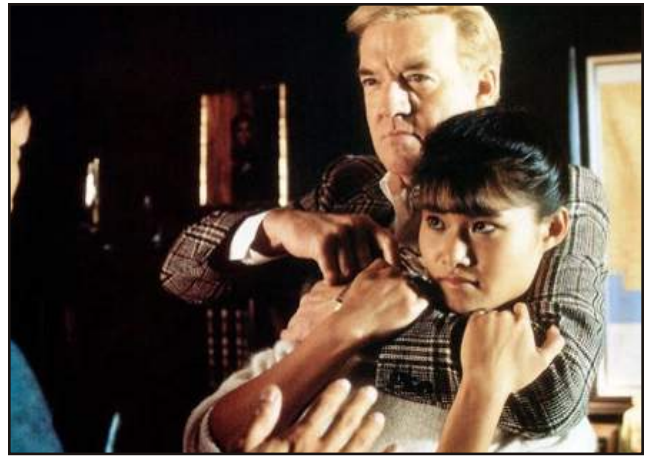
Lawndale, the well-dressed hostage-taker.

The only clue Vinh left behind was the piece of paper with the suspect shipping