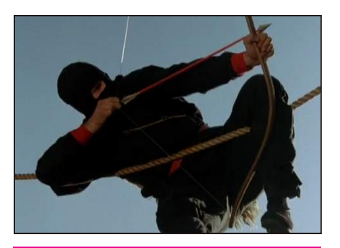
The ninjas are coming for you.