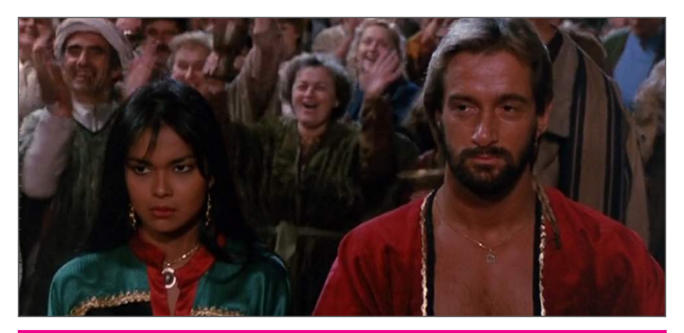
The princess is thrilled about her wedding to Zamir.

anyone trying to avoid an obstacle will be instantly killed. Also, ninjas hunt the contestants as they go along.