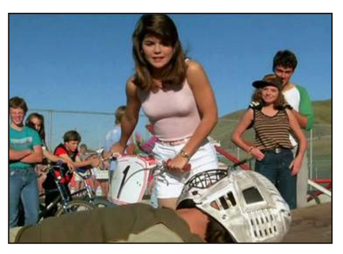
Christian schools Cru

This brings me to another high point for the movie: the soundtrack. It's full of 80s