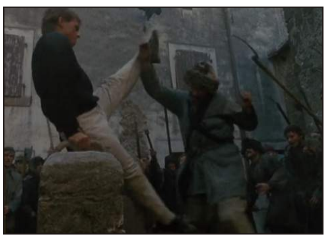
Note the well-placed pommel horse.