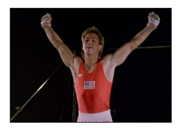
Karate gymnast in training.

Not only is Gymkata the second movie featuring an American Olympic gymnast in this issue of Girls , on Film (in addition to Rad ), but it is also a B-movie with cheesy stunts, bad acting, and karate, one of the preferred methods of self-defense in the 80s. It's hard to take this movie seriously, which actually made it kind of fun to watch. While confusing at times, Gymkata proved to be a classic bad movie that is perfectly set up for parody.