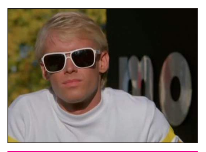
The future's so bright.