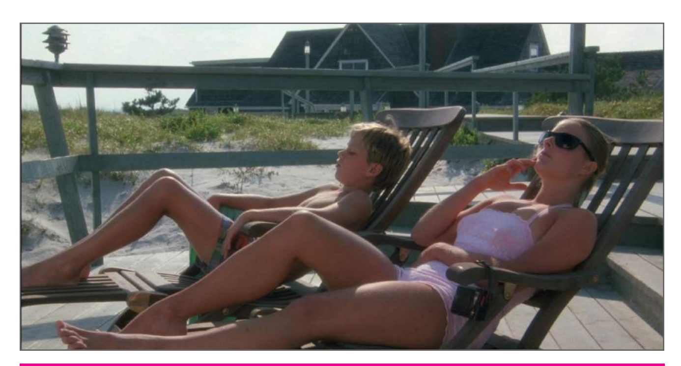
Adventures in babysitting.

loses his virginity, and then, his dad dies in a car accident. After the funeral, Billy puts his glove and uniform away in the attic, and we can only assume he intends to quit baseball for good.