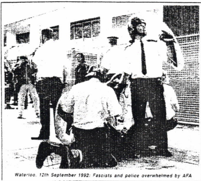
Waterloo, 12th September 1992: Fascists and police overwhelmed by AFA