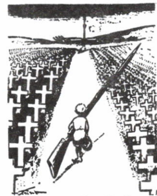
New Year — Same old path

Onward, Christian soldiers! Blighting all you meet; Trample human freedom under pious feet. Praise the Lord whose dollar sign dupes his favored race! Make the foreign trash respect your bullion brand of grace. Trust in mock salvation, serve as tyrants' tools; History will say of you: "That pack of god - damned fools!"