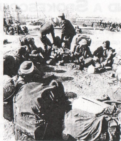
Affinity groups occupy Seabrook, 1977.

in Spain during the Spanish Civil War. The Spanish Anarchist movement is an exhilarating example of a movement that was able to reorganize much of society based on decentralization, direct democracy and the principles behind them.