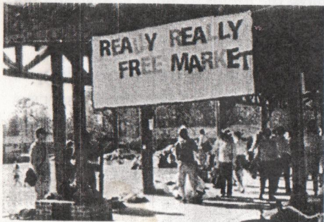
Participants share and enjoy free items and skill-shares at Really Really Free Markets

and straight-up giving can provide a way to meet our basic needs, while contributing what we have to the common good. Exchanges like these teach us to value people for their talents and the things we can share, instead of seeing each other as only bosses, employees or consumers.