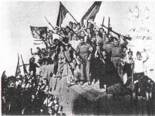
EAI militants fight fascism during the Spanish Civil War.

Whether your affinity group is taking action in a mass protest or not, there are a range of roles that could be necessary to pull off your plan of action, even beyond what is included here. Other roles might include: scouts, police liaisons, media documenters, distractions, people to transport materials, people to make decisions for the group in high-pressure environments, and more!