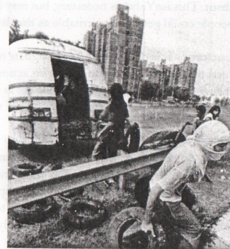
Protesters blockade roads, Argentina 2001.

Anything! They can be used in massive protests or small, clandestine actions. Affinity groups can be used to drop a banner, blockade a road, change the message on a massive billboard, do street theater, provide back-up for other affinity groups, decorate buildings with revolutionary slogans, etc...There can even be affinity groups who take on particular tasks in a large protest setting. For instance, there could be a roving affinity group made up of street medics, or an affinity group who brings food and water to people blockading intersections.