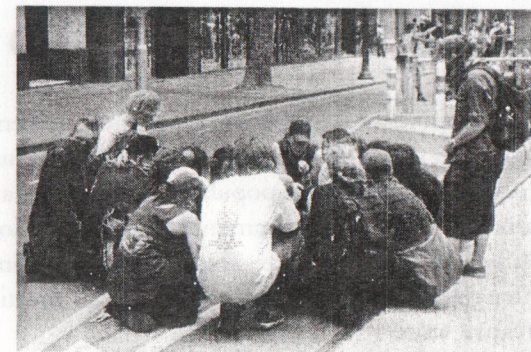
An affinity group makes a collective decision in the streets during anti-G20 protests, Australia 2006

In that case, people can raise the concerns with the proposal in different ways. Participants can block the proposal, meaning they feel so strongly against it that they will prevent the decision from moving ahead. If even one person blocks, the proposal is prevented from going through, and discussion resumes until a new proposal emerges or the old one is modified. Alternately, participants can stand aside, meaning that they have qualms with the decision but won't prevent it from being made. They can state their concerns to the group, which makes note of it for the future, and the decision moves ahead.