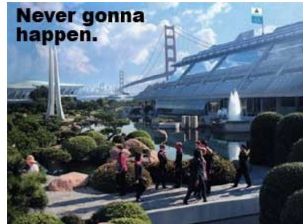
The only way that will come true is if you believe that bullshit.

Science fiction could offer discourse on how to become human in more novel, free, and beautiful ways. It could inspire more diverse, involved, and radical politics. It could provide a safe space for people to discuss radical perspectives around race, gender, and politics outside of academic settings. That it currently doesn't is indicative of the state of the popular imagination: dystopic, disillusioned, and depressed.