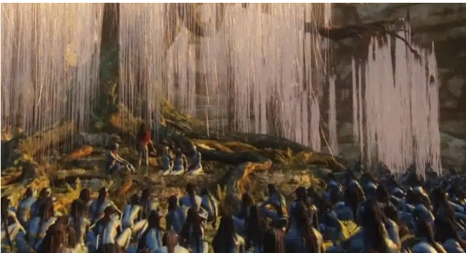
Avatar aliens prey to the mother-goddess/their planet to save them

Science Fiction has become synonymous with movies with poorly written scripts and high special effects budgets. This is a long way from sci fi's origins as a bizarre genre of literature akin to Westerns and Romance novels. That major Hollywood movies are now sci fi has been largely detrimental to the critical aspects of science fiction literature and to its usefulness in cultivating a radical political imagination.