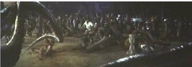
Primitive islanders pray for King Kong to save them from the giant octopus

A perfect example of this phenomenon is the 2009 movie Avatar. Released in 3D, it became the highest selling movie of all time. The visual effects are