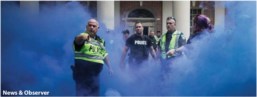
News & Observer

About 100 anti-racist counter-protesters gathered to have a canned food drive and “Nazis Suck Potluck” while neo-confederate protesters & members of a group called “CSA II”, one with a swastika tattoo, honored Sam’s stump. Police confiscated the canned food (throwing it into a chained trashcan because they alleged that the cans were “weapons”), tackled, pushed, and choked protesters, and threw a smoke bomb at students, ultimately brutally arresting eight demonstrators. (Taking the arrest count for fall 2018 to 24 defendants by this point.)