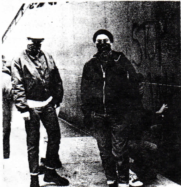
Skinheads in protest of U.S. interference in Nicaragua Minneapolis, MN-1988

While many skins are nationalists, and proudly display the flag of their country, we are against this. Being nationalist goes against what being a skin means to us. Patriotism is a tool of the politicians and the rich of all nations to make the working class fight one another, instead of fighting their real enemies. Nationalism has poor kids killing each other in wars, and blaming foreigners and immigrants for the lack of jobs (instead of the corporations who exploit us all). Patriotism has been responsible for slavery and the massacre of millions of indigenous people. Instead of nationalism, we promote pride in our class and culture. We believe in uniting the international working class against the rich bastard rulers who screw us over every day.